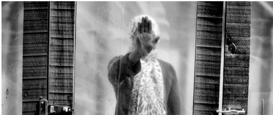
Woman from Morocco trapped in forced labour. "Whenever the lady of the house left, she would lock me up for hours in the veranda, with only one small bottle of water."

Secretary-General António Guterres stated that 'the world is well on its way to meeting the target of ending the AIDS epidemic by 2030'... and asked all to make the AIDS epidemic a thing of the past."